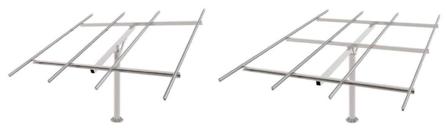
Pole Mount 6#